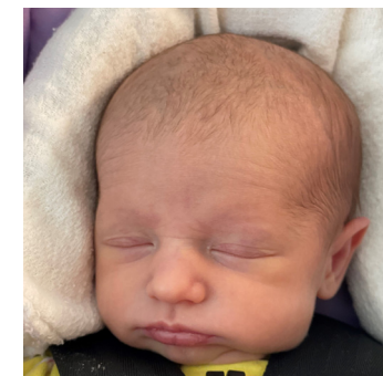
Update- What a joy to have Mom & Dad come by to introduce the TPC team to this little one we have been praying for!