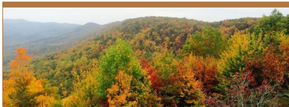
To everything there is season, and a time for every purpose under Heaven..." Ecclesiastes 3:1